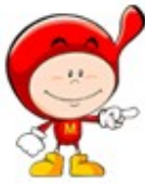
Photo theme, DIY your photo to theme - Seamless fit!

*for a better view, plz visit our site: at http://www.mmmooo.com/eng/ or backup site http://211.136.104.12:8098/index.htm * *if you are from our partner's channel, you dont need to see the payment this step*